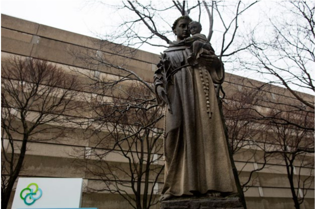
A statue outside of Presence Saint Francis Hospital in Evanston, Illinois.

suffer similar harms when seeking reproductive health care. These patients often face additional discrimination on the basis of their gender identity when seeking this and other kinds of care at Catholic hospitals. We note also that reproductive health services are provided by a broad array of clinicians, all of whom would be subject to a Catholic hospital's religious restrictions on care. This report emphasizes the experiences of physicians only because those are the stories that arose most often in our investigation.